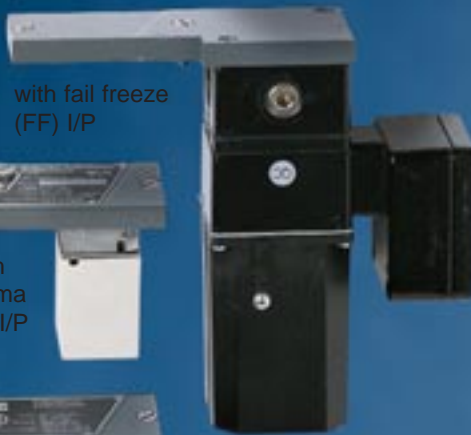
with fail freeze (FF) I/P