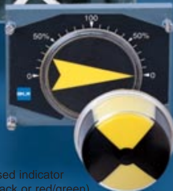
Add standard cover with pointed indicator