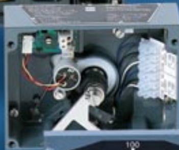
add feedback module at any time (switches and/or 4/20 transmitter)