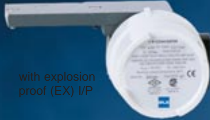
with explosion proof (EX) I/P