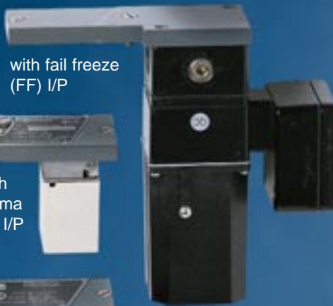
with fail freeze (FF) I/P