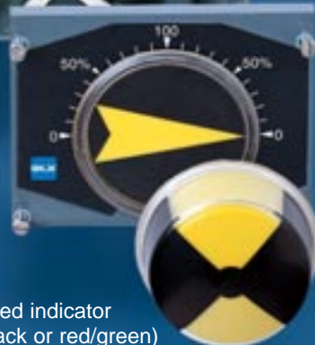
add standard cover with pointed indicator