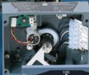
add feedback module at any time (switches and/or 4/20 transmitter)